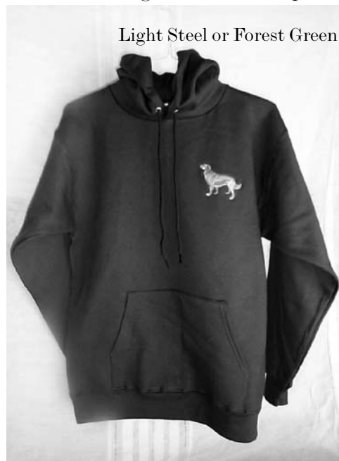
Light Steel or Forest Green