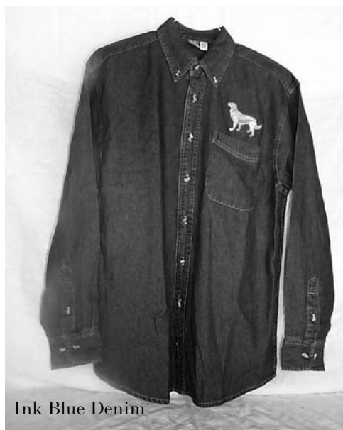
Ink Blue Denim