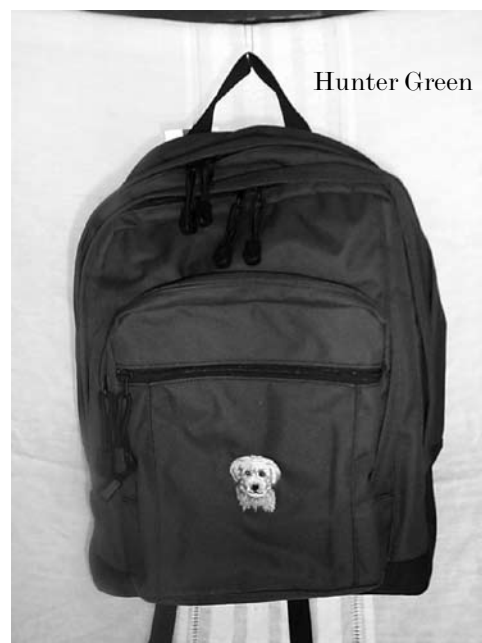
NGRR Backpack $59.00