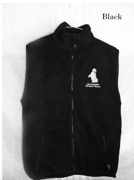
NGRR Front Zippered Fleece Vest $36.00