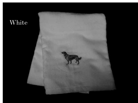
NGRR Beach Towel $24.00