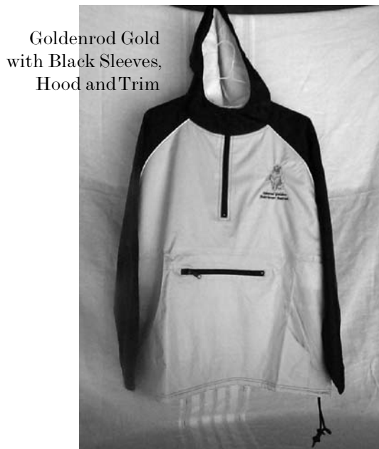
Goldenrod Gold with Black Sleeves, Hood and Trim