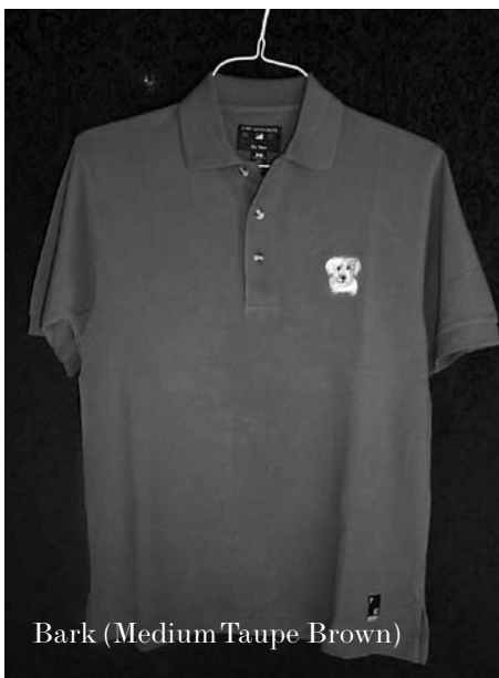
Bark (Medium Taupe Brown)