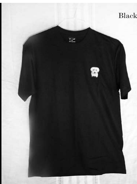
NGRR Hanes Beefy-T™ Shirt $14.00