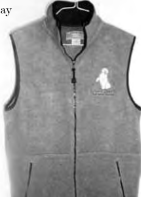
NGRR Front Zippered Fleece Vest $36.00