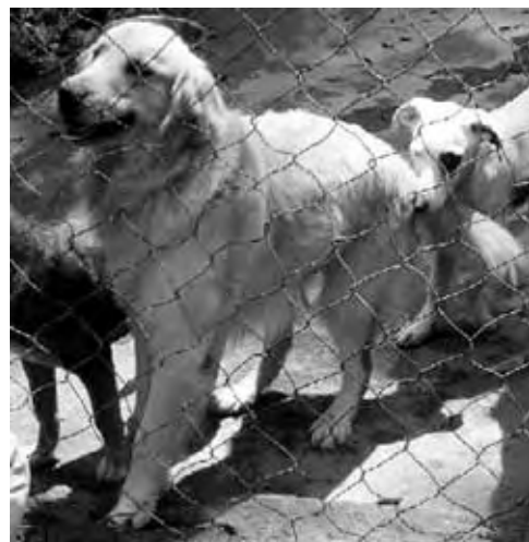
Bindi at Animal Aware in Guatemala.