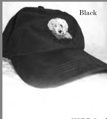
NGRR Suede Cap $17.00