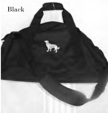
NGRR Large Duffel Bag $42.00