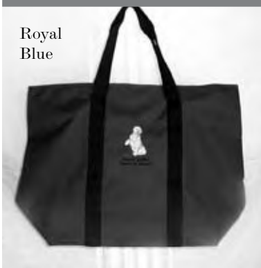
NGRR Port Authority All-Purpose Tote $24.00