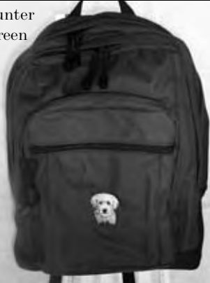
NGRR Backpack $59.00