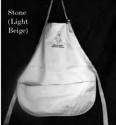
NGRR Medium Length Apron with Pouch Pockets $19.00