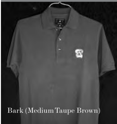
NGRR Pique Knit Polo Shirt $34.00