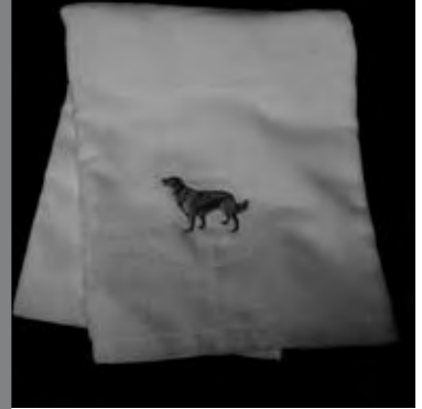
NGRR Beach Towel $24.00