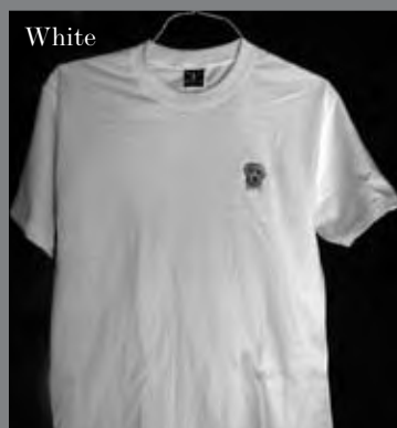
NGRR Hanes Beefy-T™ Shirt $14.00