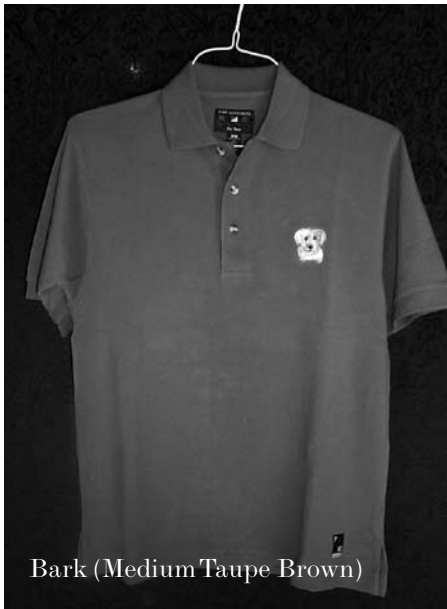
Bark (Medium Taupe Brown)