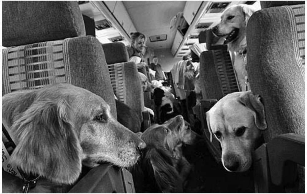
First -class treatment for dogs escaping Hurricane Katrina.

The most interesting observation I made was that the two groups I worked with were very different. The first group of dogs that I saw was the dogs rescued from Katrina. Most of their dogs were not neutered and many