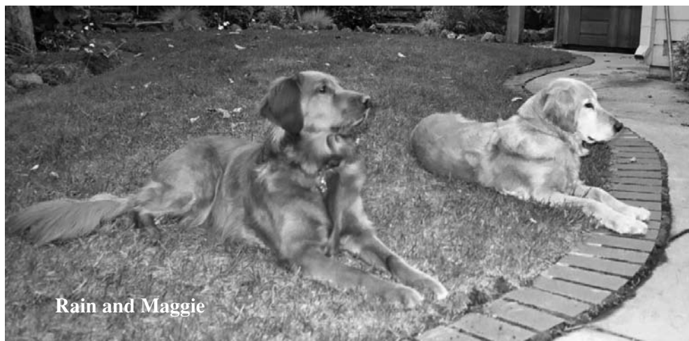
Rain and Maggie

bed. True to form, by 6 am, she's up ready for her day. We don't need an alarm clock; we have Rain. She jumps on our bed and gives us a morning greeting. Actually, it's her way of reminding us that it's breakfast time.