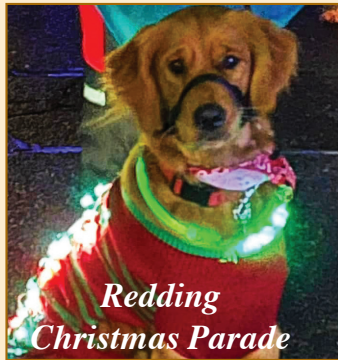
Redding Christmas Parade