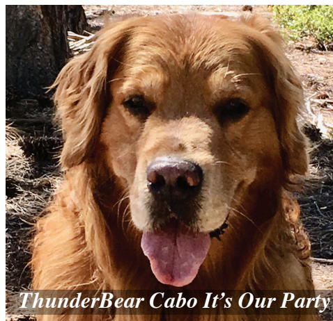
ThunderBear Cabo It's Our Party