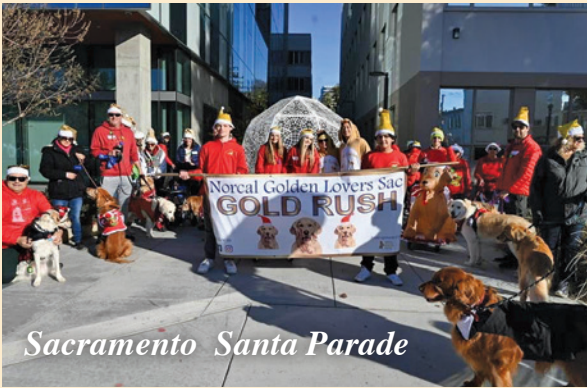
Sacramento Santa Parade