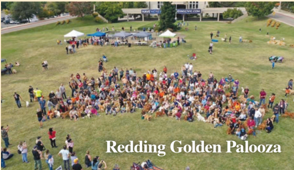
Redding Golden Palooza