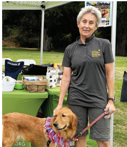
Bark In The Park Sept 2023