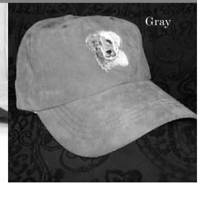
NGRR Suede Cap $17.00