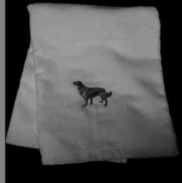
NGRR Beach Towel $24.00