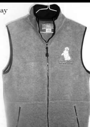
NGRR Front Zippered Fleece Vest $36.00