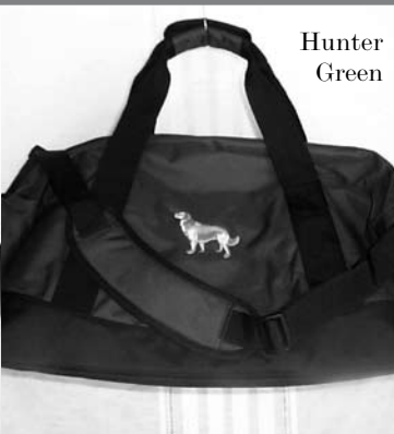
NGRR Large Duffle Bag $42.00

Goldenrod Gold with Black Sleeves, Hood and Trim