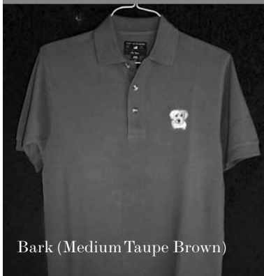
NGRR Pique Knit Polo Shirt $34.00