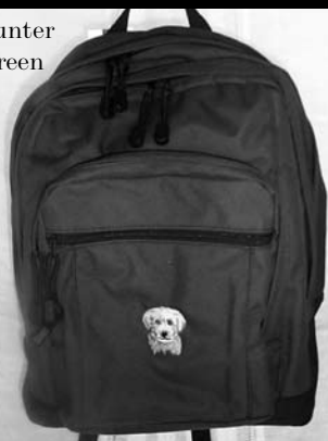
NGRR Backpack $59.00