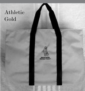
NGRR Port Authority All-Purpose Tote $24.00