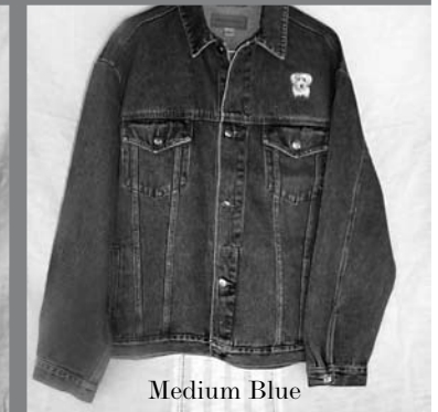
NGRR Authentic Denim Jacket $69.00