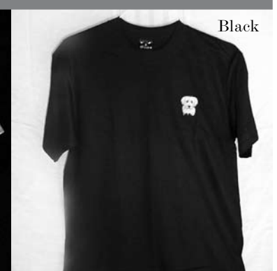
NGRR Hanes Beefy-T™ Shirt $14.00