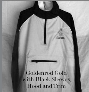
NGRR Color Anorak Pullover Jacket $60.00

Goldenrod Gold with Black Sleeves, Hood and Trim