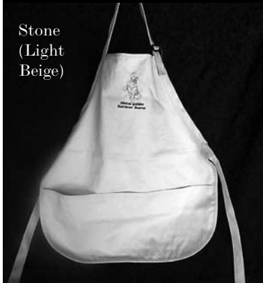
NGRR Medium Length Apron with Pouch Pockets $19.00