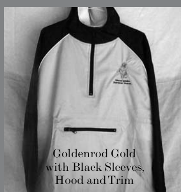
Goldenrod Gold with Black Sleeves, Hood and Trim