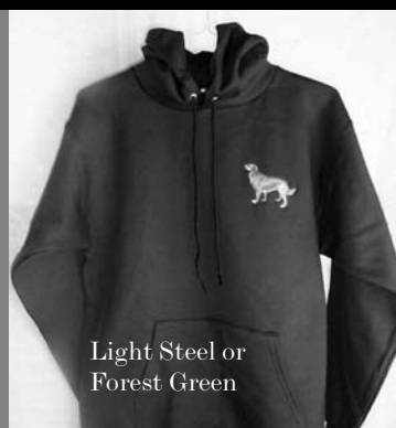
Light Steel or Forest Green