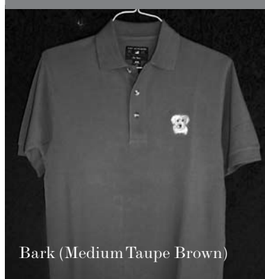
Bark (Medium Taupe Brown)