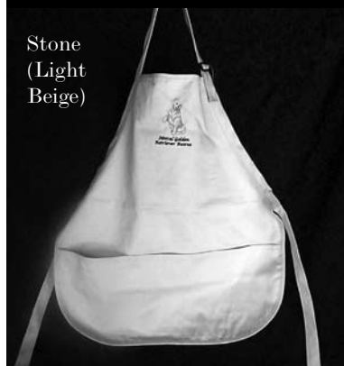
Stone (Light Beige)

The Store Is Open! See golden-rescue.org for color photos