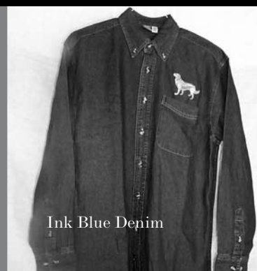
Ink Blue Denim