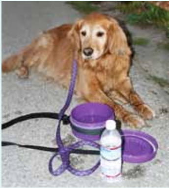
Relaxing after a walk.