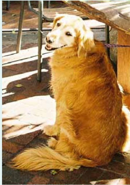
Dining at the Hog's Breath Inn in Carmel.