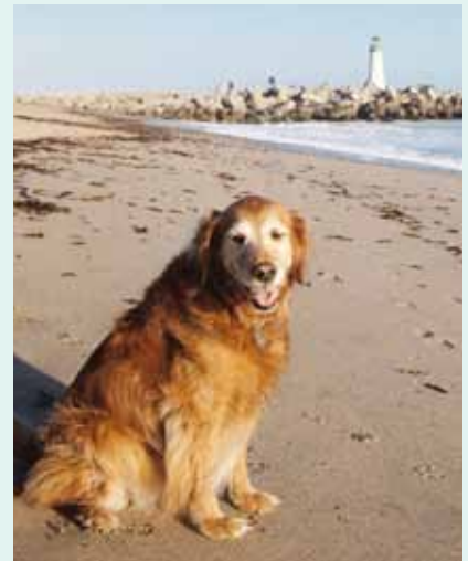
Fun at Lake Tahoe, Cressy Field, San Francisco and Santa Cruz.